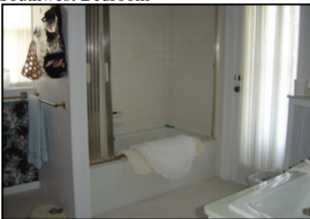
Full bath on second floor