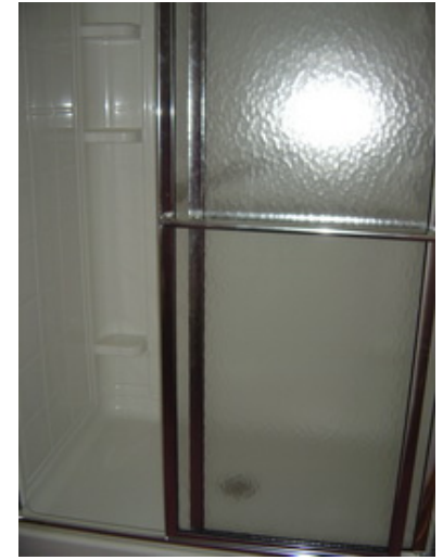
New shower in bath on main level