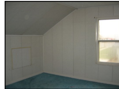
Open area upstairs.