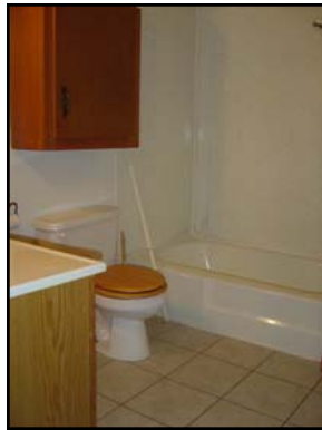
Another view of bath