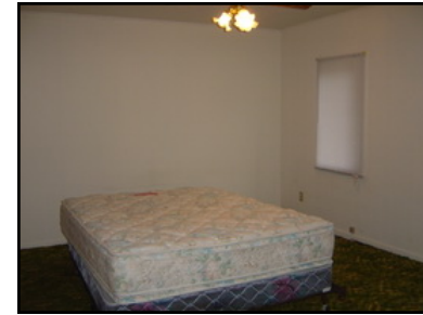
Down stairs bedroom