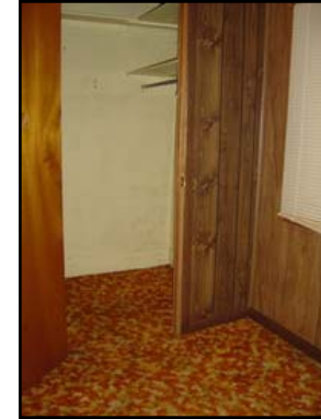
Dressing room & closet of bedroom down stairs