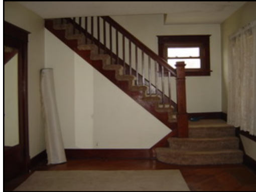
LIVING ROOM WITH OPEN STAIRS