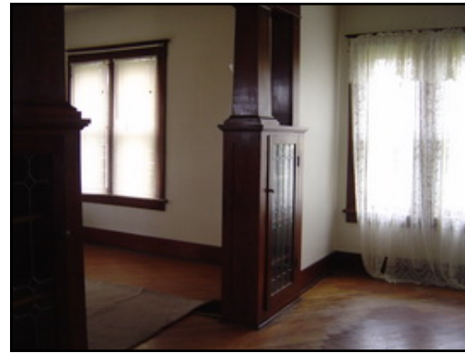
DINING ROOM AND LIVING ROOM