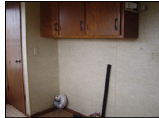
LAUNDRY ON MAIN LEVEL