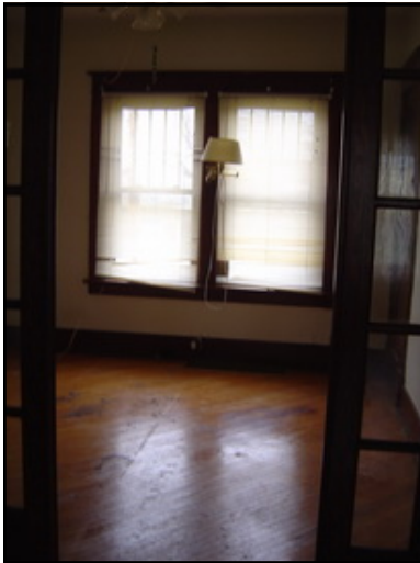
DEN OR OFFICE