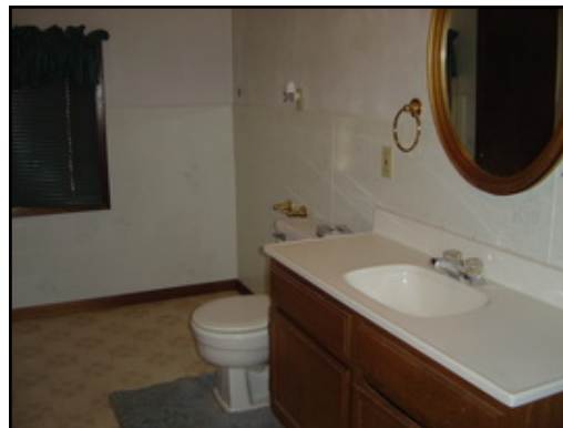
BATH ROOM UP

This information has been carefully compiled by the staff of First Choice Realty from sources deemed to be reliable but is not guaranteed by First Choice Realty.