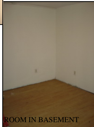
ROOM IN BASEMENT