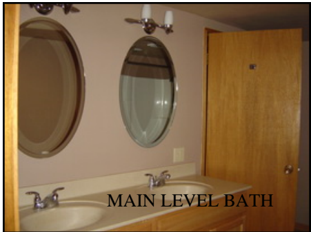
MAIN LEVEL BATH