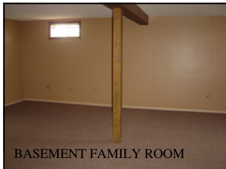
BASEMENT FAMILY ROOM