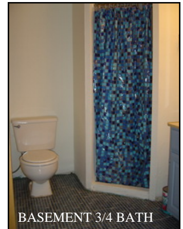
BASEMENT 3/4 BATH

This information has been carefully compiled by the staff of First Choice Realty from sources deemed to be reliable but is not guaranteed by First Choice Realty.