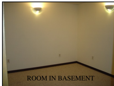
ROOM IN BASEMENT