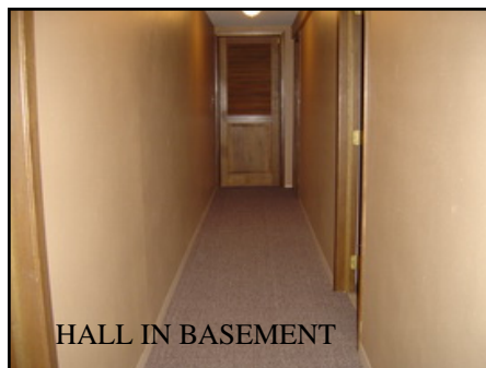
HALL IN BASEMENT