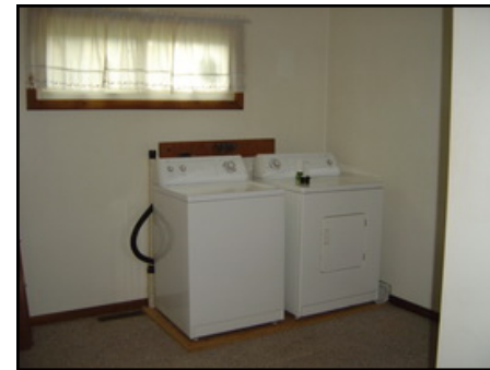
SW bedroom made into a laundry room